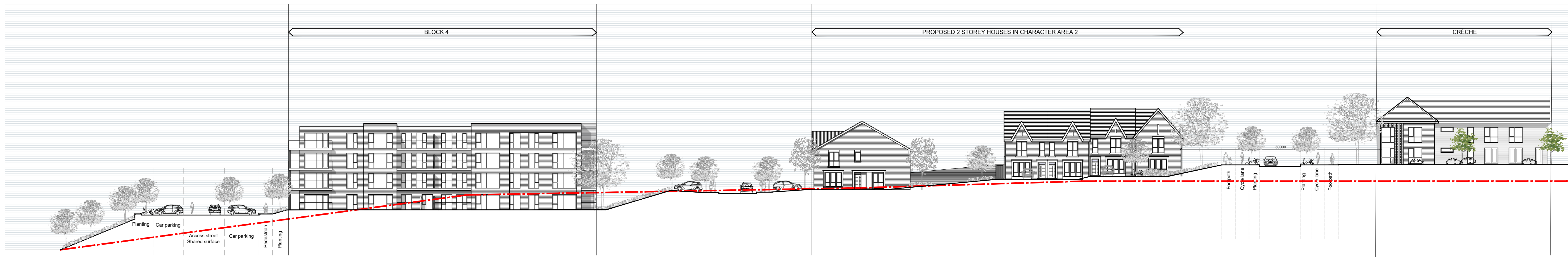
CONTEXT ELEVATION A-A CHARACTER AREA 2 IN RELATION TO PROPOSED LINK STREET AND CRECHE ADJACENT SCALE 1:250 @A0