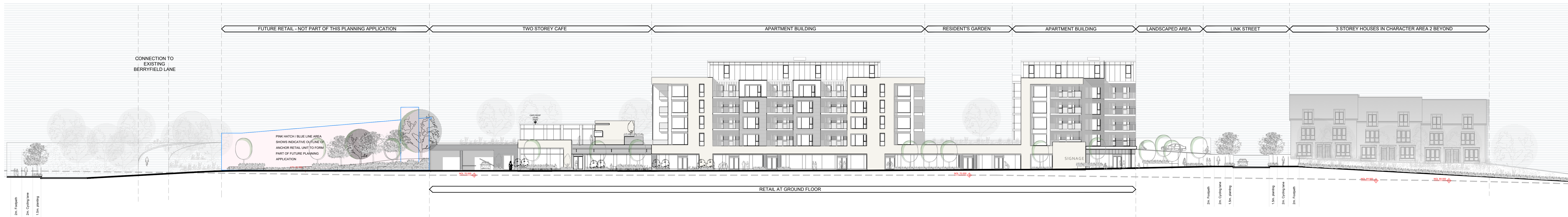
CONTEXT ELEVATION C-C NEIGHBOURHOOD CENTRE AND ADJACENT CONTEXTUAL 3 STOREY HOUSES IN CHARACTER AREA 2 SCALE 1:250 @A0