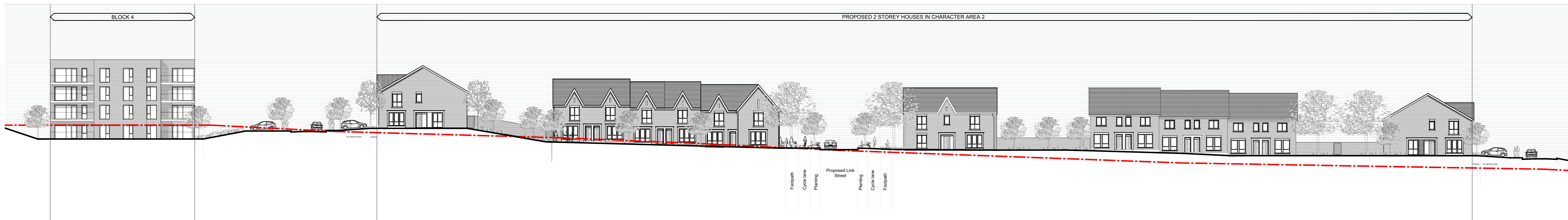
CONTEXT ELEVATION D-D CHARACTER AREA 2 POCKET PARK AND APARTMENT BUILDING 4 IN CONTEXT WITH HOUSES SCALE 1:250 @A0